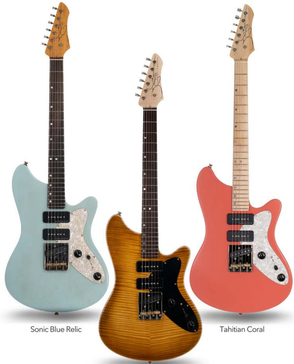
Sonic Blue Relic

*Because our guitars are hand-crafted, there may be minor variations in the above dimensions.